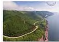
C.B.I - N.S.